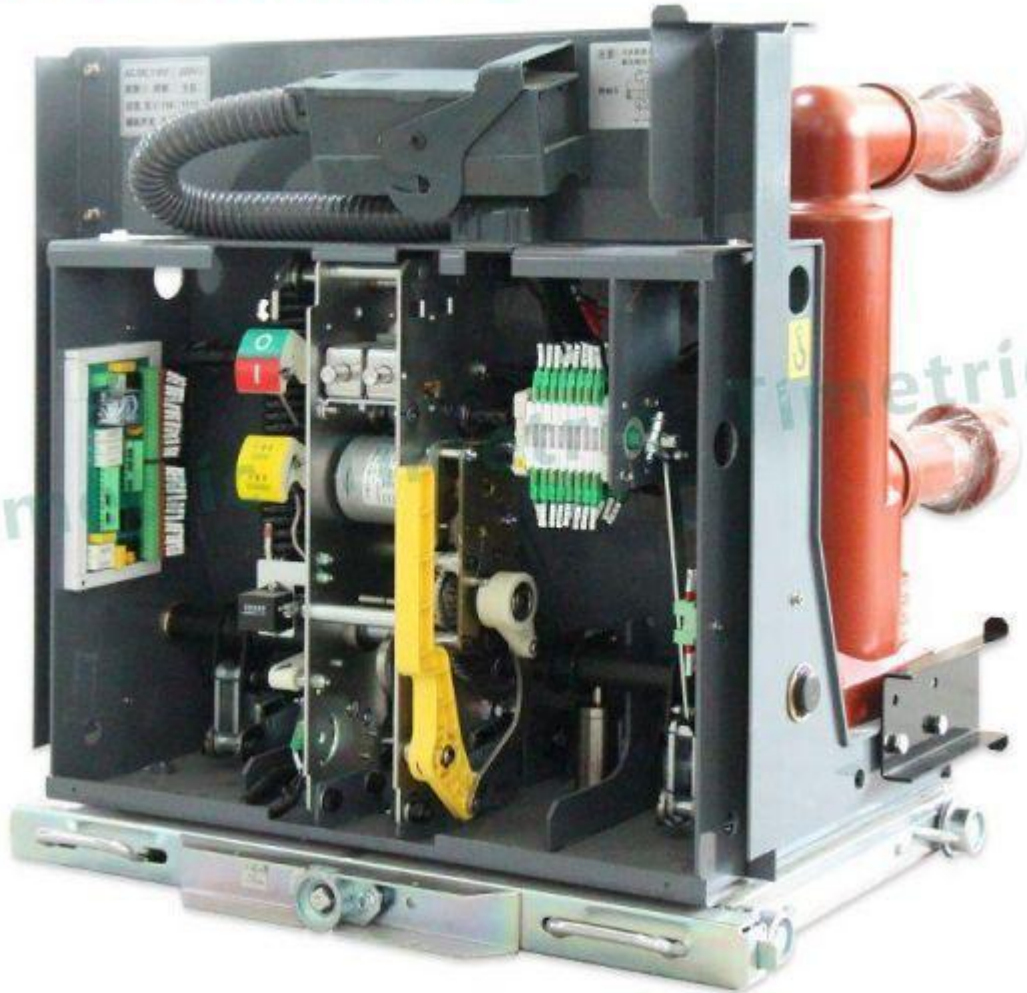
Timetric Handcart Type Vacuum Circuit Breaker Details